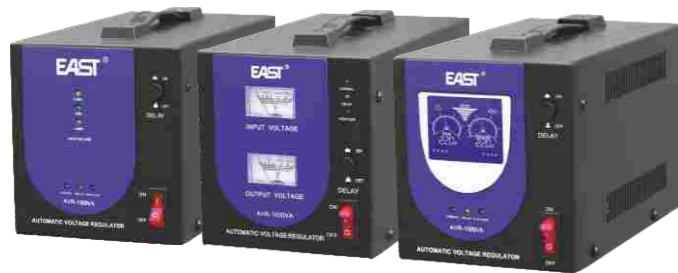
500VA ~ 5000VA

AVR series AC automatic regulators apply the advanced control technology with well qualified components. It has the features of wide input voltage compatibility, high reliability, output voltage stabilizing, energy saving etc.; it has over voltage and low voltage protection and delayed output protection etc.. it could supply stabilized power to lights, TVs, air-conditioners, refrigerator, computers and duplicating machines and other household equipment in schools, offices, hotels, meeting rooms where the stabilized voltage is needed.