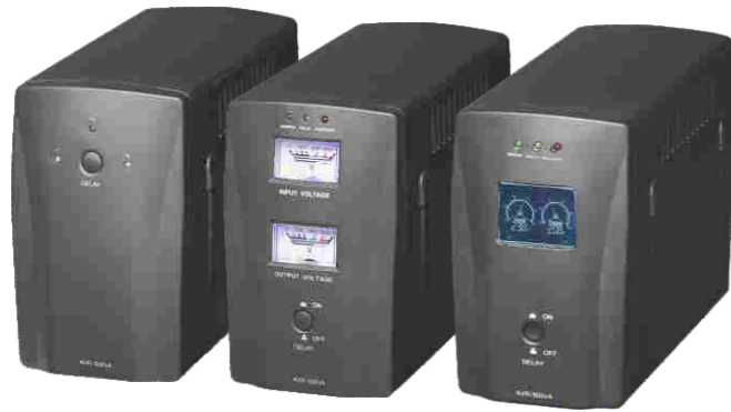
500VA ~ 1000VA